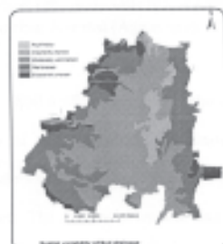
Fig 4. Spatial variability of soil drainage in the study area