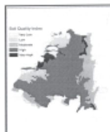
Fig 7. Spatial variability of soil quality index map in the study area