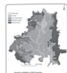
Fig 6. Spatial variability of soil erosion status in the study area