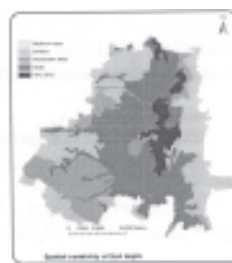
Fig 3. Spatial variability of soil depth in the study area.