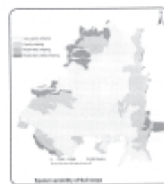
5. Spatial variability of soil slope in the study area