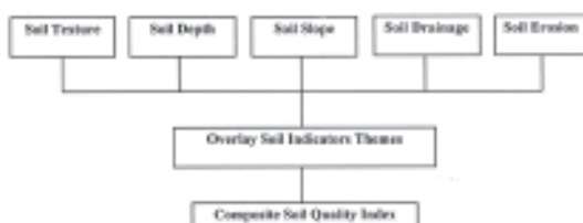
Fig. 1. Schematic diagram for SQI

The soil quality assessment is expressed in terms of soil quality index and in this study it is derived by a function of five factors namely soil texture, soil slope, soil depth, soil drainage and erosion status. The quality rating is based on the guidelines of FAO.