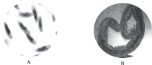
Fig. 1. Life stages of Chironomus larvae A. Midges and B. Blood worm.

filled in 675 m 2 with fresh water up to a height of 0.60 meter added 1.0 kg of composted cattle dung which attracts the Chironomus flies to lay the eggs. This organic manure is acts as a fertilizer to produce algal blooms which used by larvae as feed. The fiber tanks were covered by mosquito net to prevent the entry of mosquito and other insects. Worm like light red colored larvae comes out from the tube and with the growth larvae turn to blood red color and harvest with scope net of 500 micro mesh (Fig 1.). The number of larvae was counted by cell counting method "Sedgwick Rafter" [13].