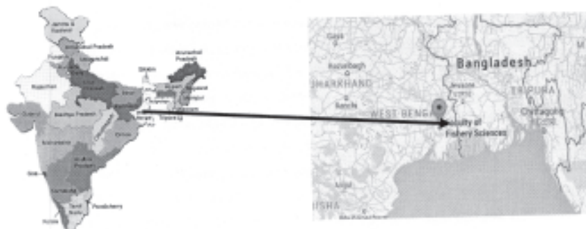
Fig. 1. Map of the study area.

28^{\circ}48'' N and longitude 88^{\circ}23'5'' E, 88^{\circ}24'5'' E, 88^{\circ}24'3'' E) where hard water pond is a serious problem (Fig. 1). It comes under costal alluvial soil zone where the surface water is slightly saline and rainwater is the major source of water. Three ponds were selected for the experimental purpose. Pond-1 (Panchasayar Lake) is situated behind Ambuja complex, is misused by local people by dumping statue after puja festival and people are used for various purposes such as bathing with soap, utensil and cloth washing. Pond 2 and 3 were situated in the Faculty of Fishery Sciences, West Bengal University of Animal and Fishery Sciences at Chakgaria campus having fishery activities. The average area of three ponds was 18000\text{ m}^2 , 2928\text{ m}^2 and 4680\text{ m}^2 respectively. The water as well as plankton samples were collected once a month over a period of one year (July 2014 to June 2015).